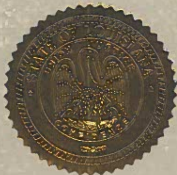
John Bel Edwards Governor

IN WITNESS WHEREOF, I have hereunto set my hand officially and caused to be affixed the Great Seal of the State of Louisiana, at the Capitol, in the City of Baton Rouge, on this 26th day of September A. D., 2021.