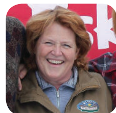
Sen. Heidi Heitkamp (ND)