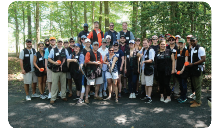
Congressional staffers learning about firearm safety and the shooting sports at the August Recess Clays Competition