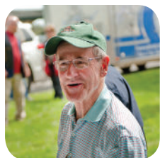
Sen. Jim Risch (ID)