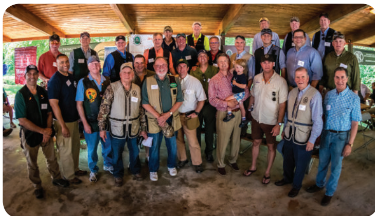
Members of Congress at the Congressional Clays Competition