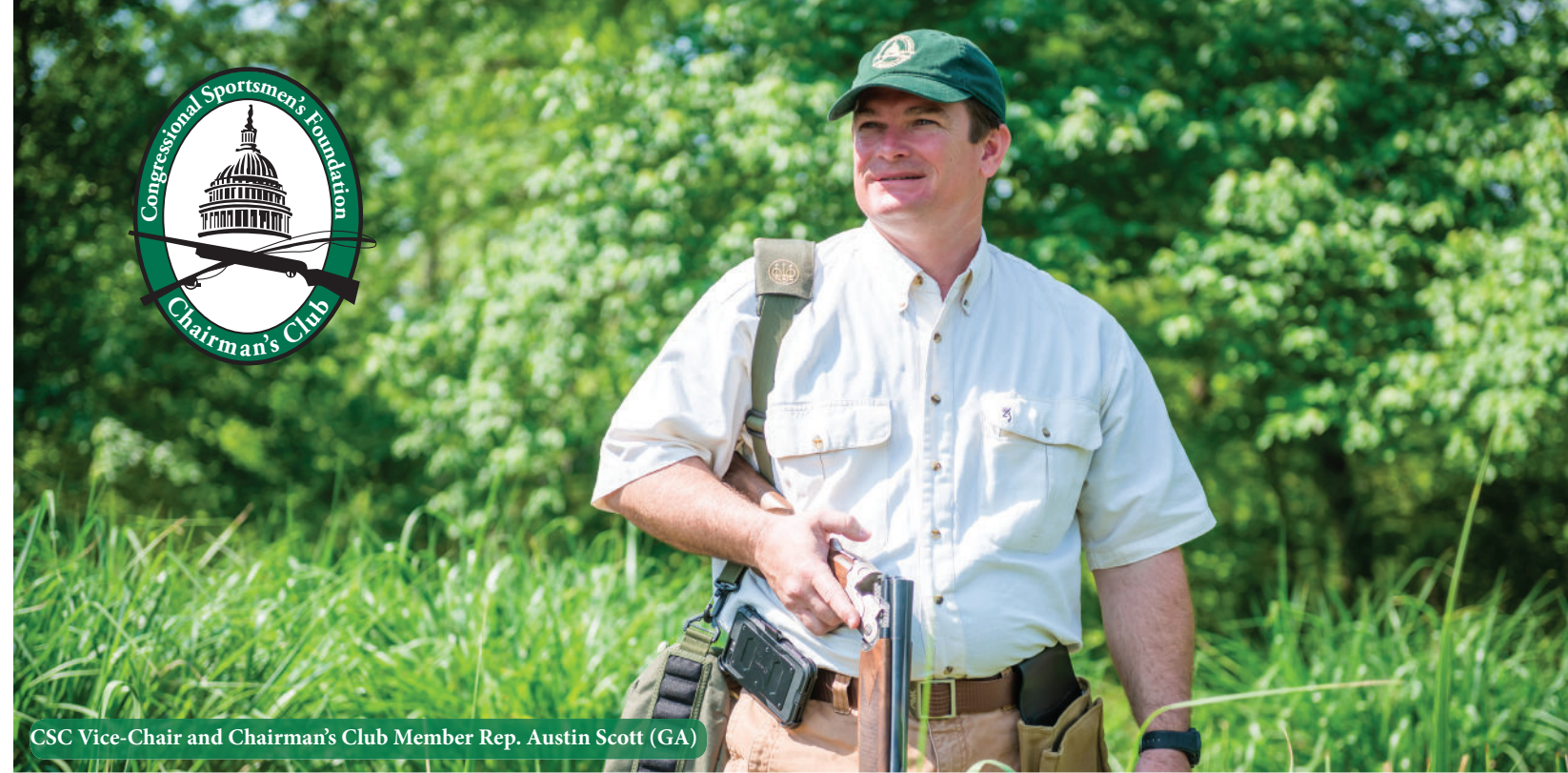
CSC Vice-Chair and Chairman's Club Member Rep. Austin Scott (GA)