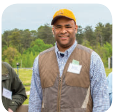
Rep. Marc Veasey (TX)

ALABAMA Sen. Doug Jones Sen. Richard Shelby Rep. Robert Aderholt Rep. Mo Brooks Rep. Bradley Byrne Rep. Gary Palmer Rep. Martha Roby Rep. Mike Rogers