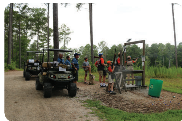
South Carolina Regional Event at the Palmetto Shooting Complex