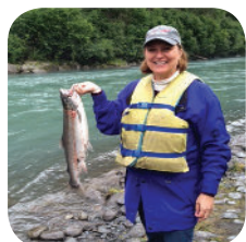
Sen. Deb Fischer (NE)