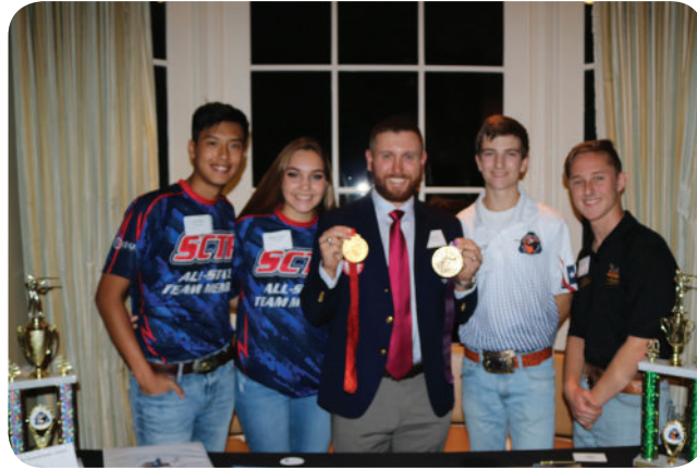
Katy Dusters Sportsman's Club and Olympic gold medalist Vincent Hancock at Texas Bass, Bucks & Boots