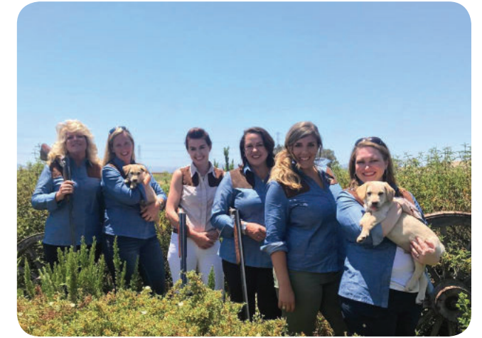
CSF staff and friends at California Wine, Wings & Wildlife