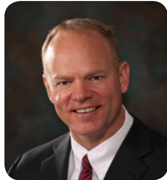
Gov. Matt Mead (WY) CO-CHAIR