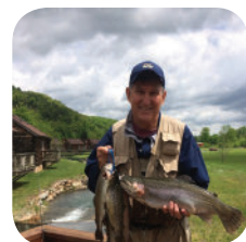
Sen. Joe Manchin (WV)