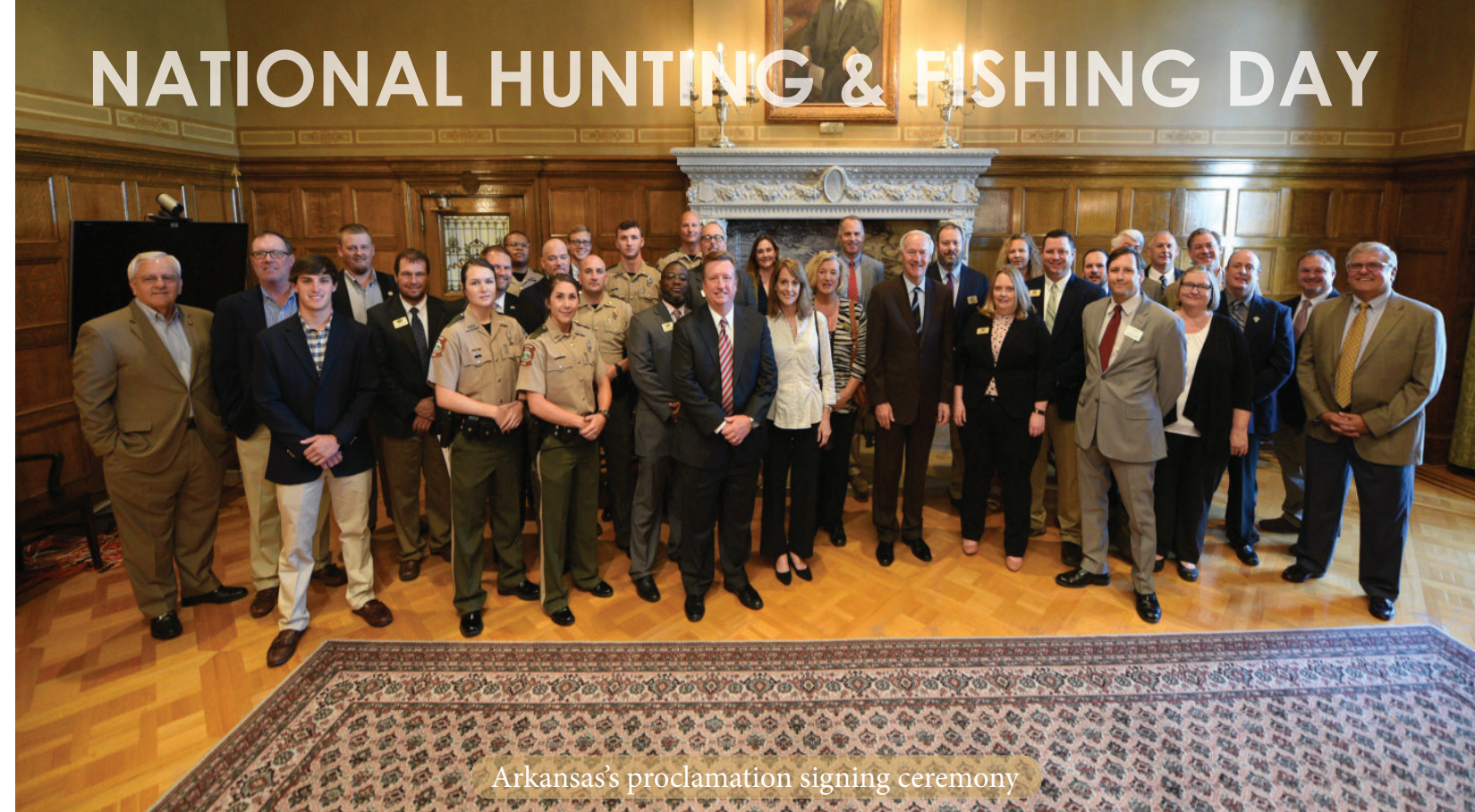
Arkansas's proclamation signing ceremony

Governors from across the country, including GSC members and President Donald Trump, have signed proclamations recognizing Saturday, September 22 as National Hunting and Fishing Day. Among these 43 proclamations is: