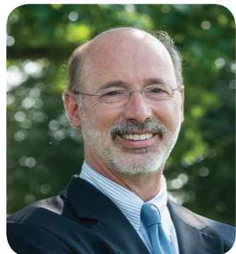
Gov. Tom Wolf (PA) VICE-CHAIR