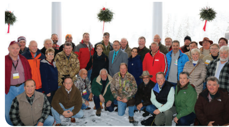
Legislators gathered at the NASC Annual Sportsman-Legislator Summit in Bretton Woods, New Hampshire