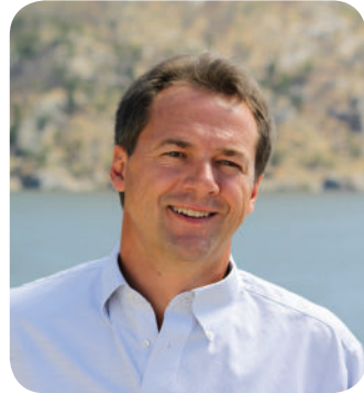
Gov. Steve Bullock (MT) CO-CHAIR

To complement the CSC and NASC, the Governors Sportsmen's Caucus (GSC) was launched in 2009 as a bipartisan caucus of governors who work to protect and advance the interests of America's sportsmen and women. The 36 member GSC facilitates communication and information exchange between participating offices in support of hunting, angling, recreational shooting and trapping.