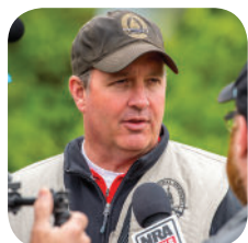
Rep. Jeff Duncan (SC)