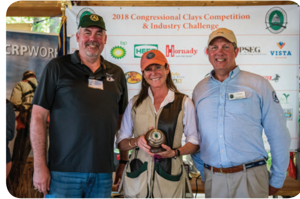
Congressional Clays Competition