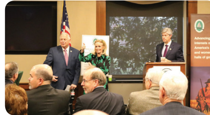
Reps. Gene Green (TX), Debbie Dingell (MI) and Jeff Fortenberry (NE) at the Recovering America's Wildlife Act Breakfast Briefing