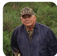
Rep. Gene Green (TX)