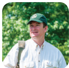
Rep. Austin Scott (GA)