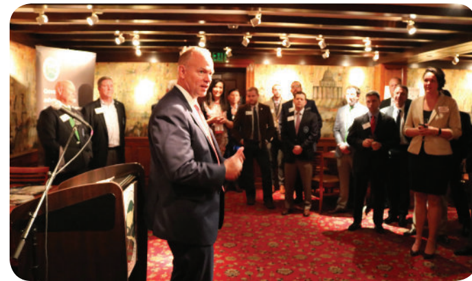
Governors Sportsmen's Caucus Co-Chair Gov. Matt Mead (WY) speaking at the GSC Winter Reception